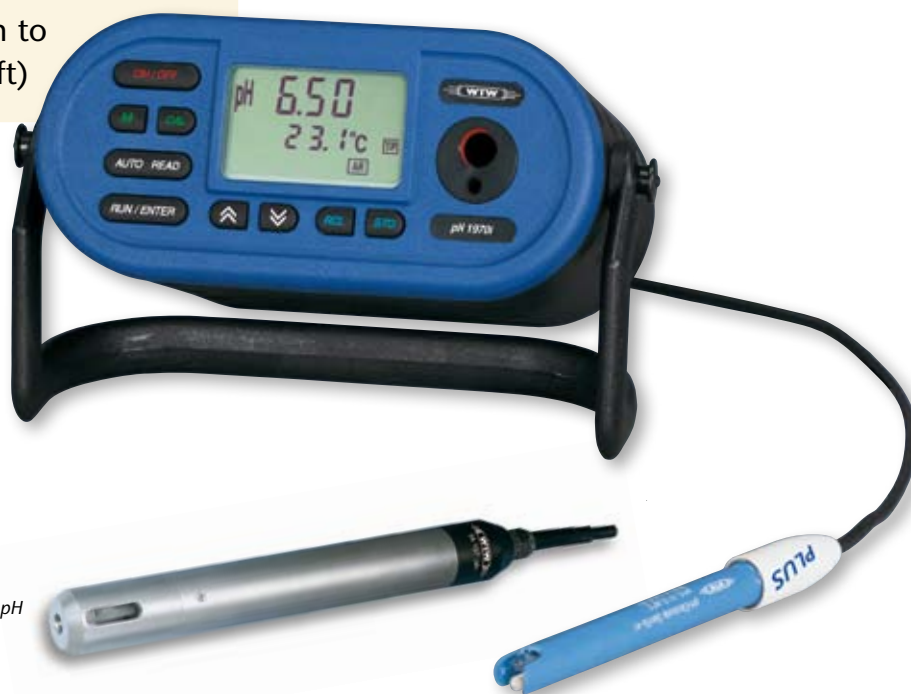
Depth armature TA 197 pH

The ProfiLine 1970i, supplied with integrated powerful NiMH rechargeable batteries, is a complete pH measuring system. When used with the TA 197 pH Depth Armature, the ProfiLine 1970i, with its built-in preamplifier, is accurate to a depth of 100 m (330 ft).